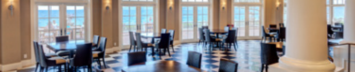
Meetings for 10 to 1,000

The premier casino destination in northern Michigan. Beautiful architectural design and superior guest service.