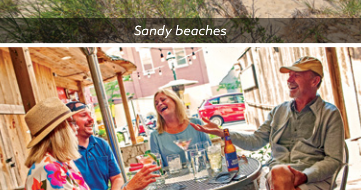
Dine inside or out