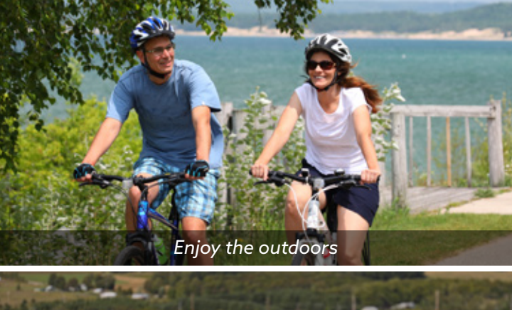
Enjoy the outdoors