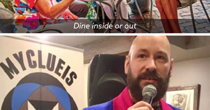
Custom trivia events